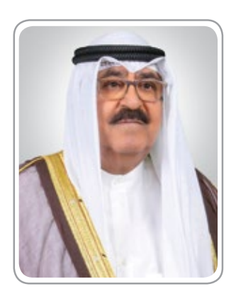
Sheikh Meshaal Al-Ahmad Al-Jaber Al-Sabah CROWN PRINCE OF KUWAIT